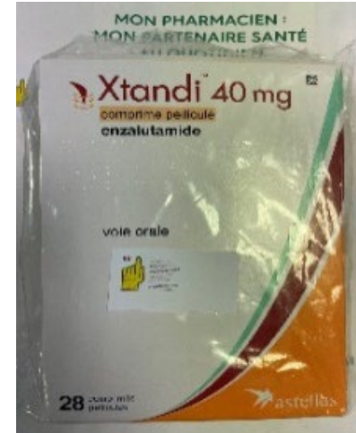
Picture 5: ESOP's yellow hand on the transport box of cancer drugs prepared by the Creil pharmacy