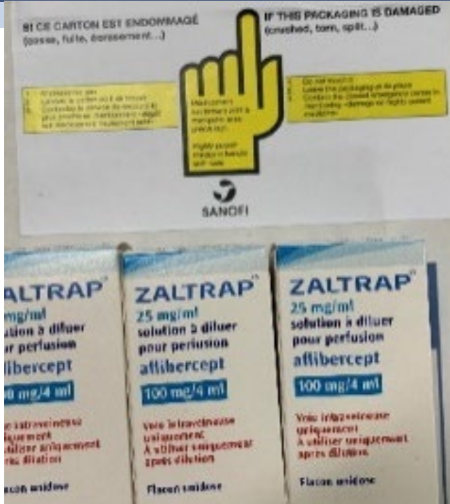
Picture 1: "Anti-cancer products" notification by ESOP's yellow hand